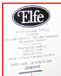
1. Black Line / Ligne noire