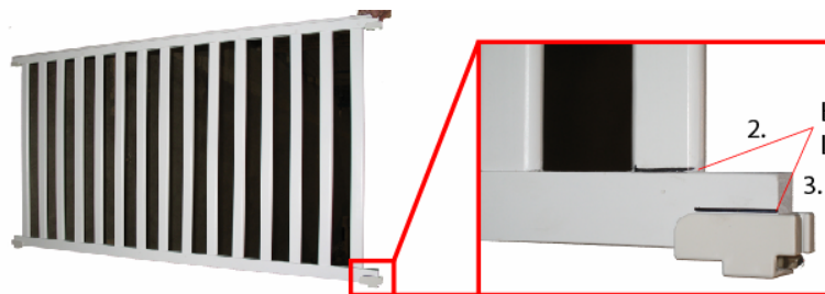
2. Black Line / Ligne noire